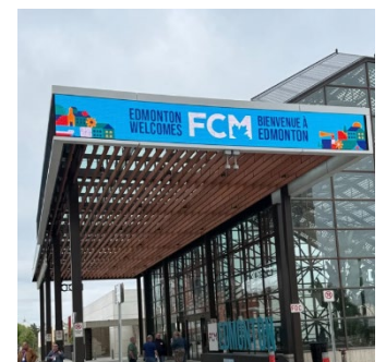
FCM 2026 Conference at the Edmonton Convention Centre

“It was very educational for me as a new CEO. We got to meet so many leaders of northern municipalities in other provinces, the territories, and up in the arctic regions. We’re excited to stay in contact and continue to learn from each other”.